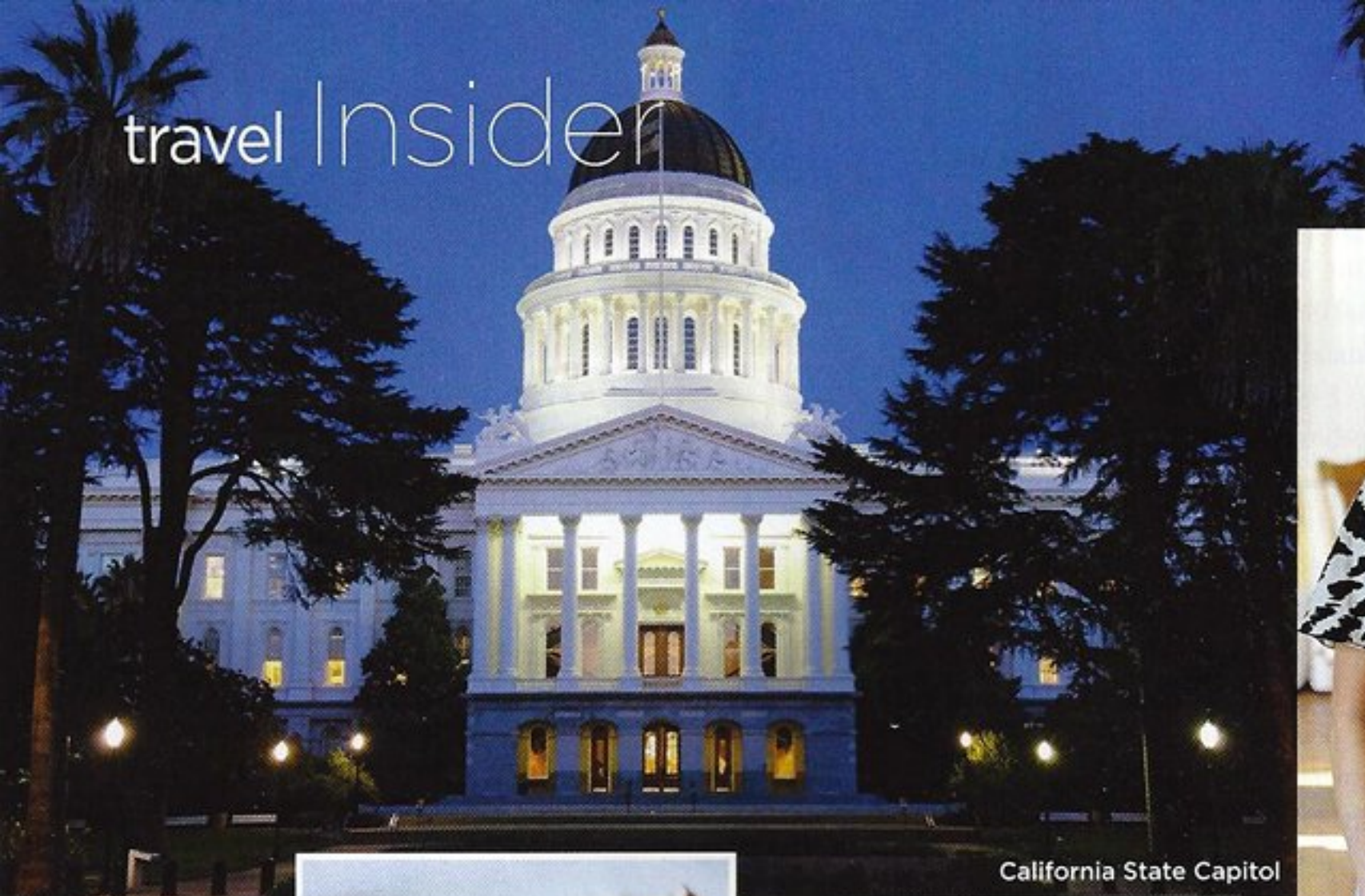
California State Capitol